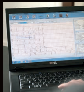
ECG Ambulatory ECG